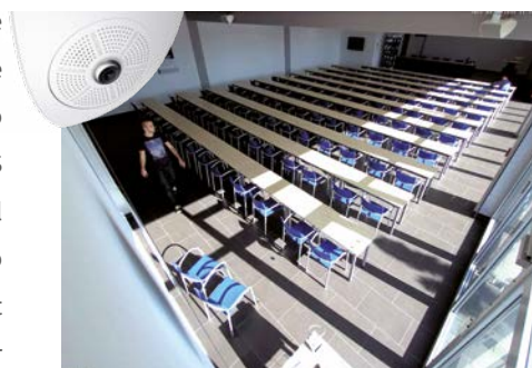
Corrected corner view with 103° (B036) premium lens

All indoor cameras are available with product options such as complete two-way audio, including microphone and loudspeaker. This system offering is easy to expand and perfect for small offices and shops, retail stores, hotels and restaurants, museums, health care, universities and schools. An optional expansion board can be plugged on the backside of the camera to realize additional IO- and alarm functions.