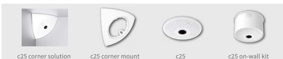
c25 corner solution