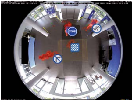
Optional video analysis MxAnalytics